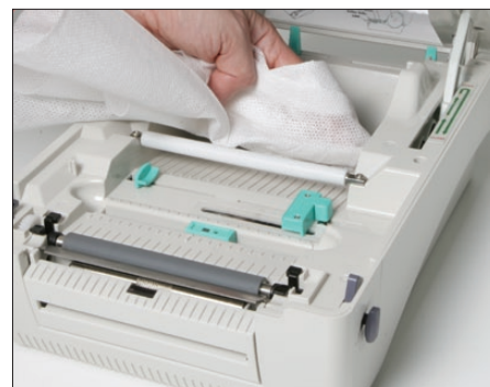
6. Clear any internal dust and debris with a dry Toshiba Cleaning Cloth.