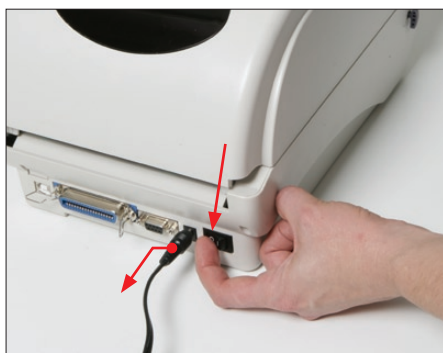
1. Turn the printer power off and unplug the printer.