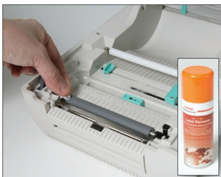
8. Remove any paper debris or label glue from the paper path, using the Label Remover if necessary (following the instructions carefully).