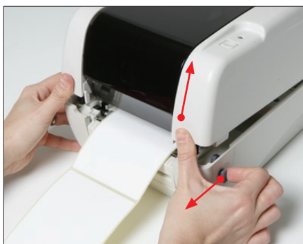
2. Open the top cover.