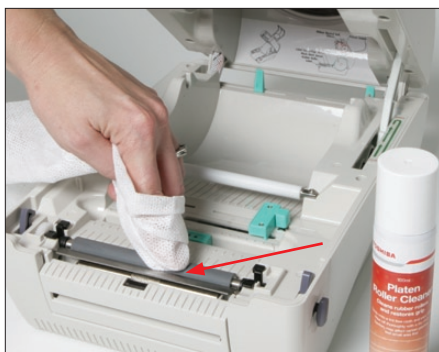
5. Spray some Platen Roller Cleaner on to a Toshiba Cleaning Cloth and gently wipe clean the platen.