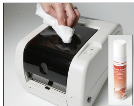
9. Close the printer and wipe the outside covers and panels with a dry Toshiba Cleaning Cloth. Remove external dirt with the anti-static Foam Cleaner, sprayed first on to a Toshiba Cleaning Cloth.