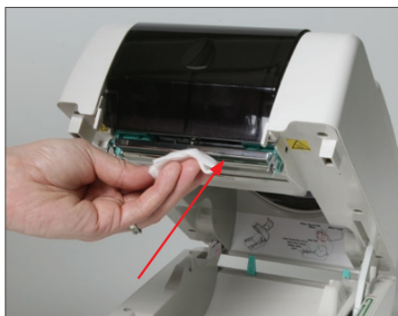
4. Either spray some Thermal Printhead Cleaner on to a Toshiba Cleaning Cloth or using a Toshiba swab or printhead wipe, gently wipe clean the printhead.